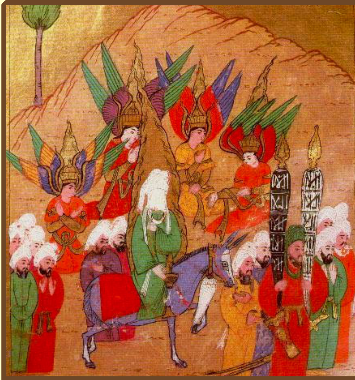
The Prophet and his companions advancing on Mecca, with the angels.

Muhammad was born in Mecca. When Muslims go on this pilgrimage they remember Muhammad's journey to Mecca from Medina with the first Muslims. Mecca is such an important place for Muslims that non-Muslims are not allowed to visit it.