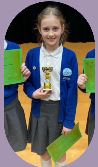
Willow from Ramsgate Arts

Watch this space for further details to follow at the start of term 4.