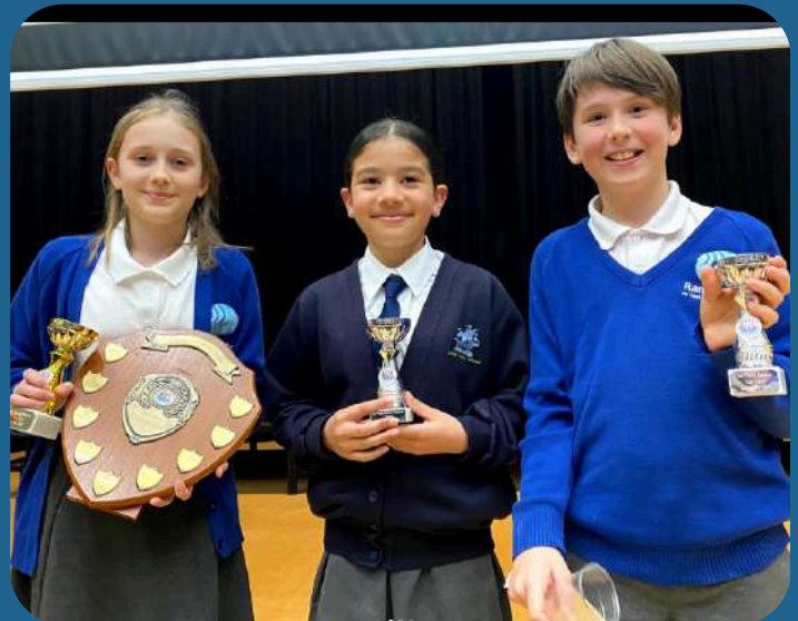
Year 5 & 6