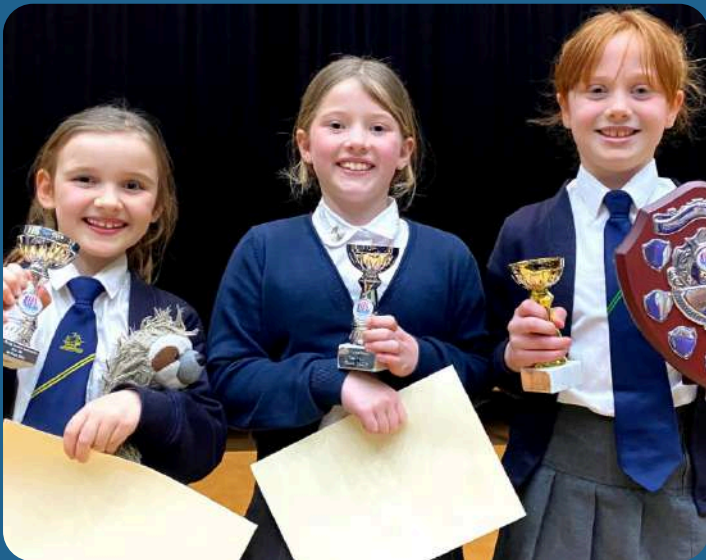
Year 3 & 4