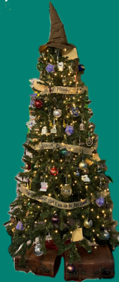
In amongst delightfully decorated trees, we even have a 'Harry Potter' themed Christmas tree at Upton.