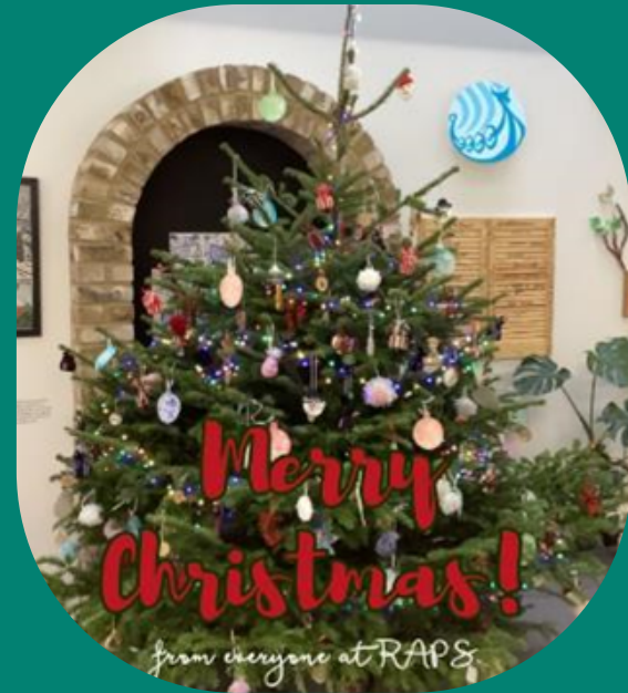
RAPS Christmas tree..